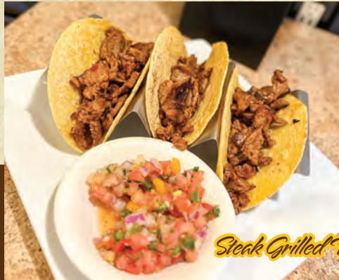
Steak Grilled Tacos

BAJA SEAFOOD TACOS 18.00 Grilled shrimp & scallops with chipotle mayo, topped with lettuce & cheese. Served with rice & beans.