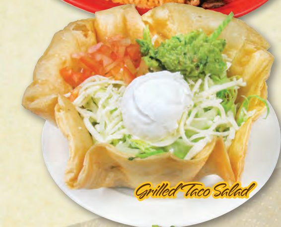
Grilled Taco Salad

Grilled beef or chicken served with rice, beans, cheese and pico de gallo.